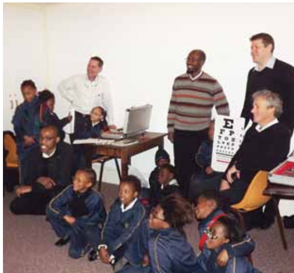
Eye Testing Day at Zonnebloem Junior School . The Mullers team with a group of young learners.